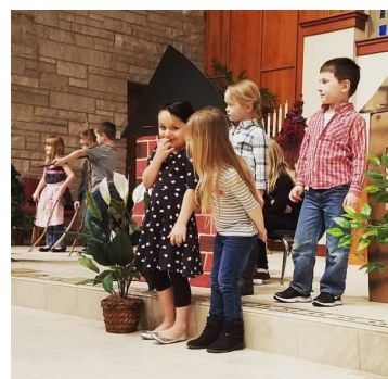
The school children perform Stone Soup .